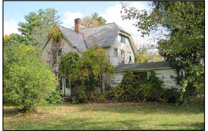
Infirmary's Westside with ward addition to the right (photo circa 2010)

Up until the end of October, Lenox School had escaped the ravages of the Asiatic Flu germ. Then this dreaded disease hit. It had already struck the surrounding communities, and as much as ninety percent of the total enrollment of some of the other prep schools had felt the effects. In this respect the infirmary has been lucky, as it has never been so crowded that all the cases could not be handled.