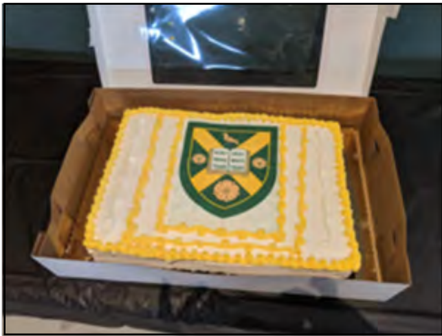
If you missed Friday night, this was part of what you missed!

Let me start by thanking Shakespeare & Co for again being gracious hosts and affording us the use of their facilities. I can't tell you how fortunate we are that they ended up with the majority of the campus. The location for the Friday night optional after golf dinner, the Sat morning business meeting and the Sat luncheon were all held at Shakespeare & Co's Bernstein Theatre.