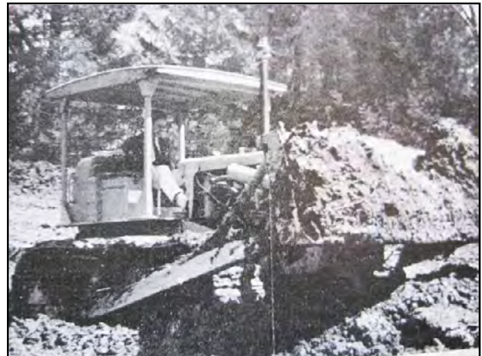
Hungerford breaks ground on Lawrence Hall - May 1963