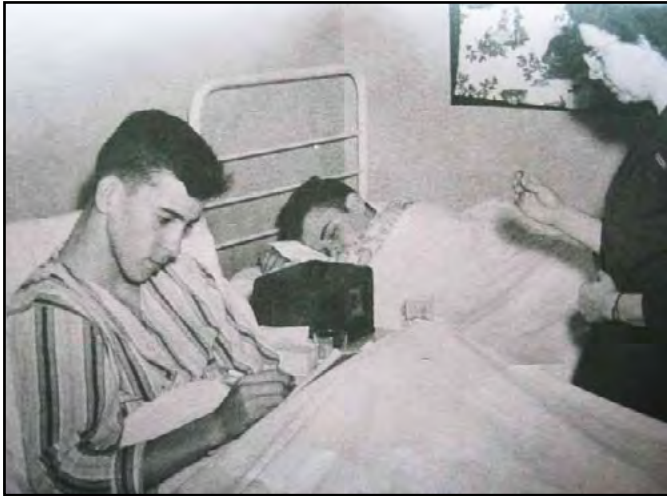
Students in Infirmary receiving care (circa unknown)