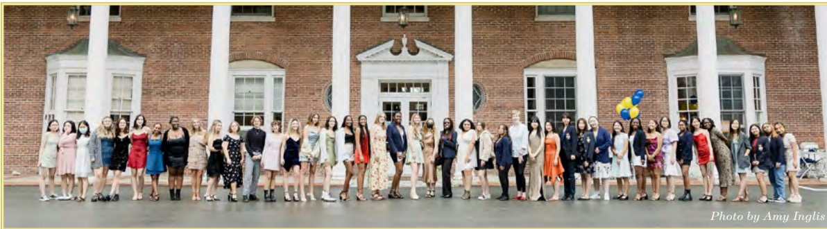
Senior Class, Miss Hall's School, 2021

LSAA scholarships to Miss Hall's students have always been received with much appreciation and fanfare. However, our support is very modest when one considers the staggering cost of attending independent schools today. According to the National Association of Independent Schools, tuition, room and board costs averaged $62,823 in 2020-21 and approximately 27% of the families received financial aid. At Miss Hall's, the cost for boarding students in 2021-22 is $64,500 ($39,000 for day students), and 73% of the student body now receive aid with an average grant of nearly $40,000. Even with a generous financial aid program, Miss Hall's cannot meet the financial needs of all students. By raising additional funds for the LSAA Endowment, we can have a far greater impact on the lives of these students.