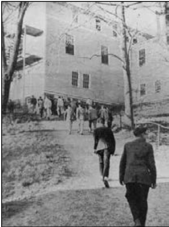
Up the hill to chapel