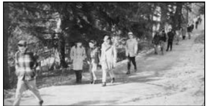
Down the hill to supper

The next issue will be published Summer 2018