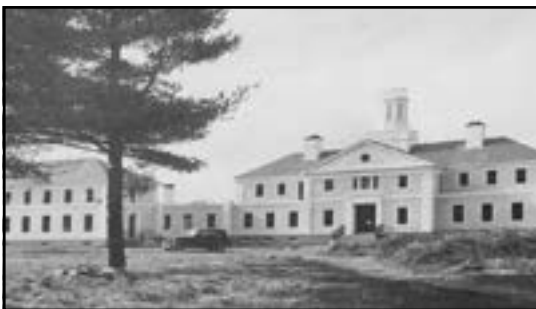
St. Martin's Hall opens in 1938