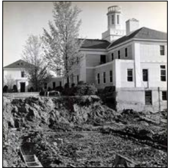
Work begins on St. Martin's North (Rice) Wing - 1956