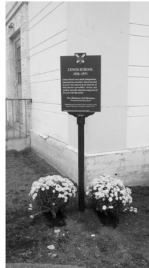
The new historical marker, in place at the southeast corner of St. Martin's