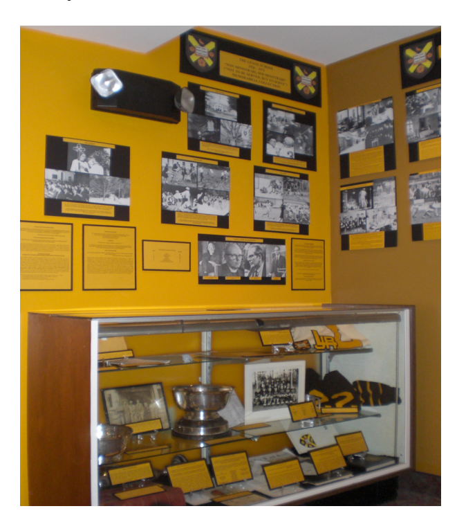
Lenox School Memorabilia on display at Shakespeare & Company's Founder's Theatre